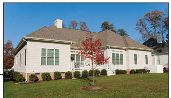
Rear of Home