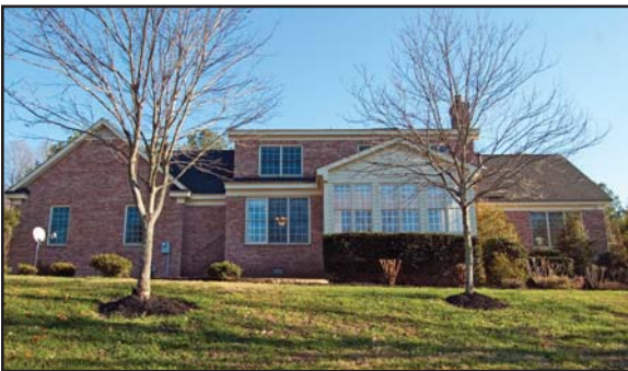
Rear of Home