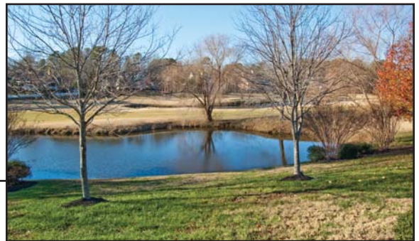
Golf & Water View