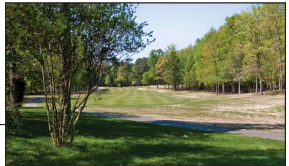
Golf Course View